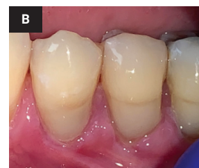
A: Large cervical lesions #'s 20 and 21 prepped B: Restored with Predicta Bulk